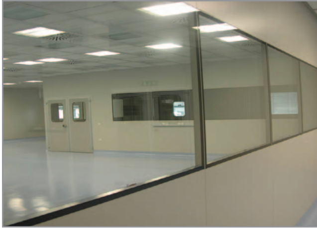
Flush interface with windows

this question, you need to assess the purpose of the cleanroom along with how you plan on cleaning your cleanroom. Are you going to use a wet or dry agent or both? Do you intend to sterilize or sanitize? Answering these questions will give you a cleanroom matched to you and not a cleanroom a vendor sold you off the shelf. Let's look more closely at some of the options available.