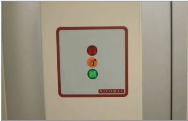
Flush interface with HPL and interlock indicator light.