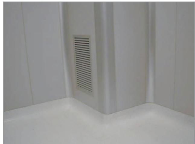
Flush interface with covings and HPL panels