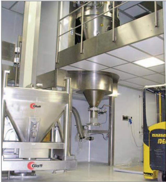
Epoxy powder-coated walls

Carbon Steel: in most cases galvanized carbon steel is used