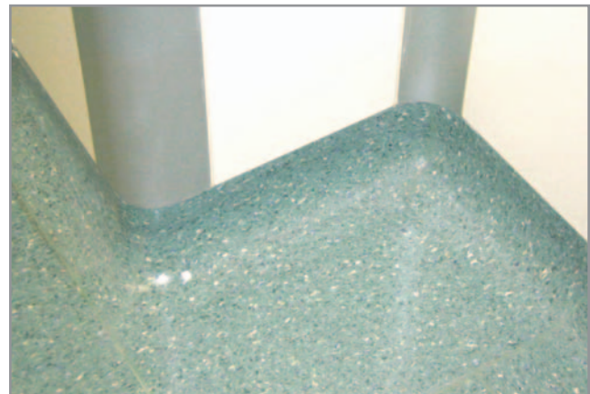
Flush interface with coverings and HPL panel