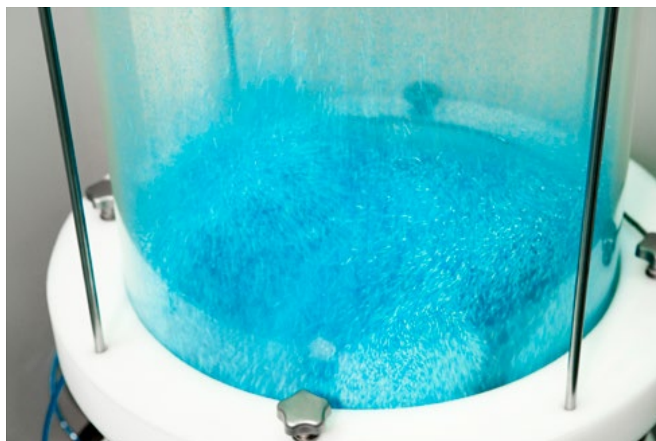
Blow Master® System